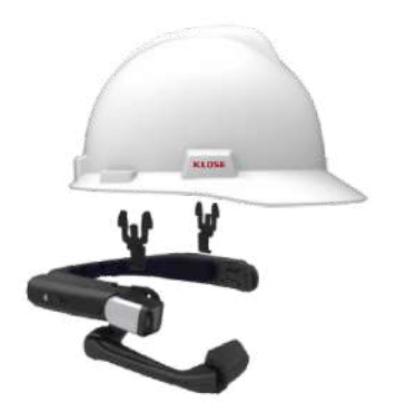
Remote Field Team Assisted Reality & ad-hoc support