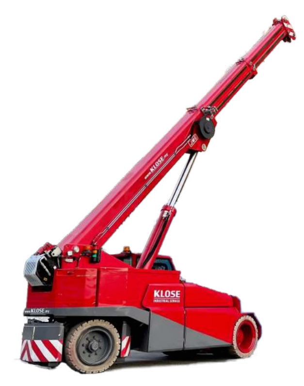
Electric Pick & Carry Crane Up to 25.0T capacity