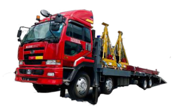
Selfloader RoRo transport up to 20T