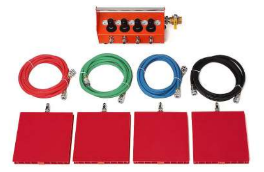
Airpad System Up to 20T capacity