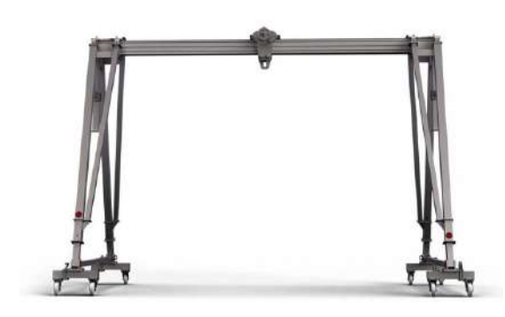
Manual Lifting Frames From 2.5 to 10T capacity