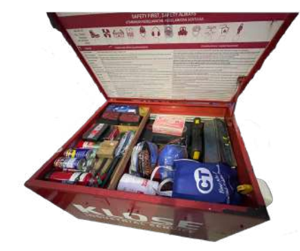
Toolsets Electric / Mechanic / Pneumatic / Hydraulic / ...