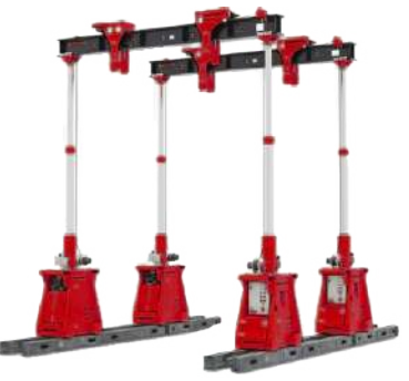
Hydraulic Gantry Electric from 30 - 65T capacity