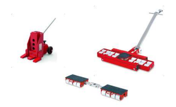
Machine Jacks & Heavy-Duty Skates Steerable / Fixed / Rotational up to 50T ea.